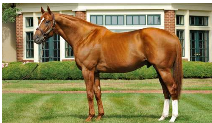
Curlin Lane's End

But the likelihood is this oversight is liable to be rectified in 2015, because there are some key pointers suggesting Curlin's shortage of GSW is temporary. Though his A Runner Index so far is a good-without-being-great 1.86, he has a very strong 2.95 Index for B Runners; 2.02 for C Runners; and a combined 2.21 Index for ABC Runners. That means that, besides his proven good horses, there are plenty of others by Curlin knocking on the door. Moreover, as you know, we also measure sires' ABC indexes at given ages: for 2-year-olds;