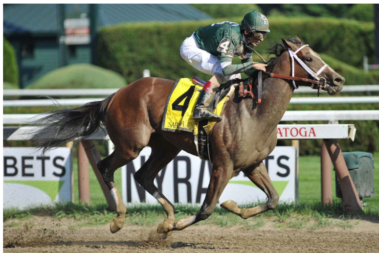
Sweet Loretta