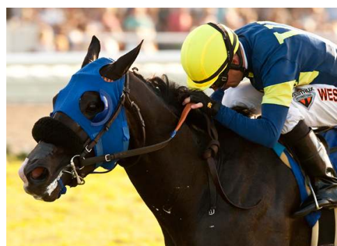
Midnight Storm