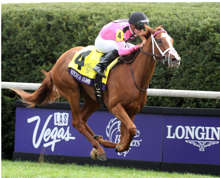
Catch A Glimpse

That history includes a win in the GI Breeders' Cup Juvenile Fillies Turf last year at Keeneland, and a nod as Canada's 2015 Horse of the Year, champion 2-year-old filly, and champion grass mare.