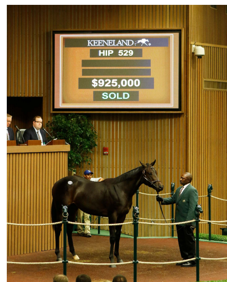
Hip 529