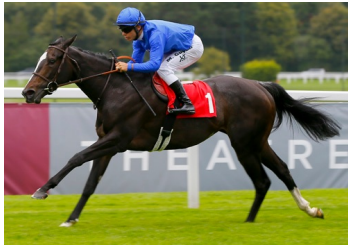
Fintry Racing Post

Despite having to ship in off an illness-induced lay-off and carry a seven-pound penalty as a result of her latest success in the G2 Prix de Sandringham, Fintry displayed much of her considerable ability to prevail with a degree of comfort and book a return ticket to