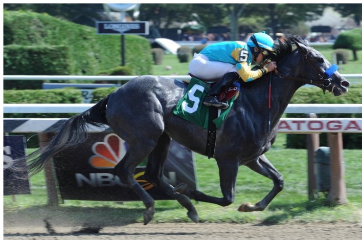
El Kabeir

1st-SAR, $83,000, Msw, 2yo, 1 1/16mT, 1:43 4/5, fm.