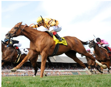
Wise Dan