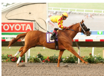
Red Outlaw