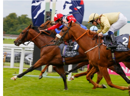
Aktabantay gets up in a blanket finish Racing Post

Runner-up over five furlongs on debut at Newmarket May 4, Aktabantay was beaten into that spot again as the 1-4 favorite for a maiden 16 days later over an extra panel at Nottingham before getting off the mark at the third attempt in a novice event at Newcastle also over six June 26. Left trailing by Estidhkaar (Ire) (Dark Angel {Ire}) when a clear second in the