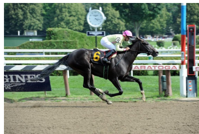
Condo Commando