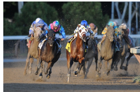
Itsmyluckyday (blinkers, left) engages Moreno (center) turning for home