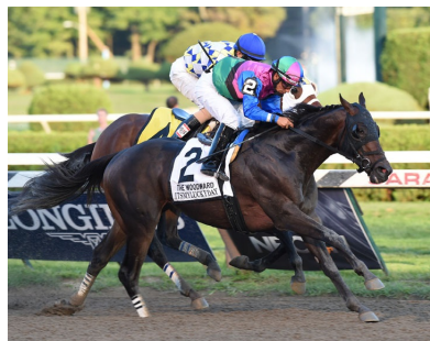
Itsmyluckyday