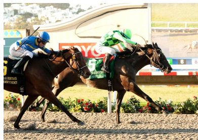
Sunset Glow reaches for the wire

A debut second going 4 1/2 furlongs over the Presque Isle Tapeta May 13, Sunset Glow easily accounted for a group of males in a June 6 Belmont turf maiden with Victor Espinoza in town to ride California Chrome (Lucky Pulpit). Second, beaten just