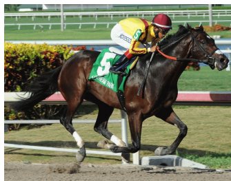
Atreides

Two impressive colts earned the "TDN Rising Star" distinction yesterday, starting with 2-year-old El Kabeir (Scat Daddy) who bound home to a 10 3/4-length success at Saratoga. Just about three hours later, the regally bred sophomore Atreides (Medaglia d'Oro) romped by 17 1/2 lengths in Gulfstream's Monarchos S.