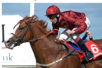
Pearl Secret

Classy but lightly raced, last year's G1 King's Stand S. third Pearl Secret had weakened into eighth when contesting the G3 Palace House S. over this trip on his