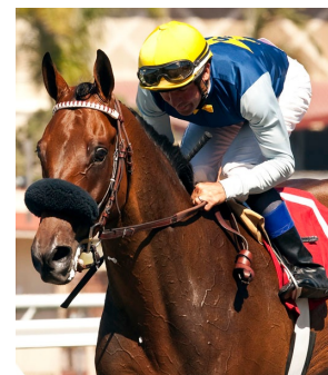
Blue Tone

Blue Tone, second in a Santa Anita optional claimer Oct. 3, closed last term with a fourth in an Arcadia allowance Oct. 27. Getting off on the right foot this year, the bay scored in his seasonal debut going a mile on the synthetic here Aug. 3 and was favored to go two-for-two in 2014.