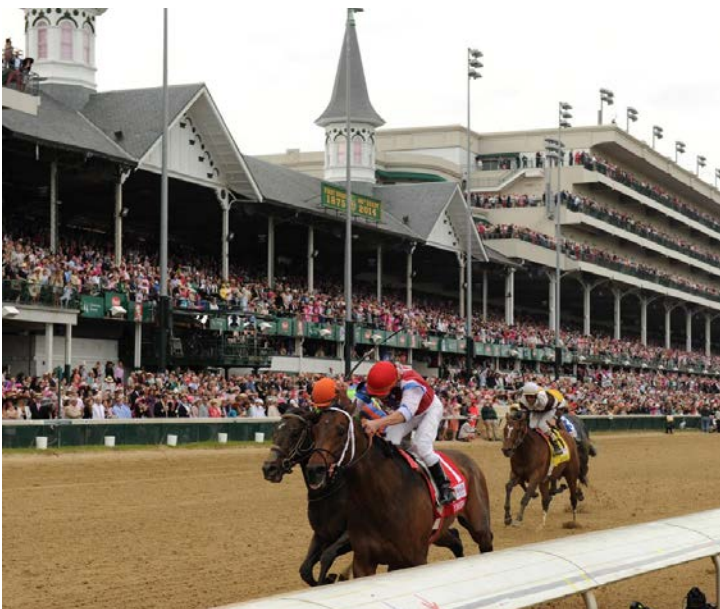
Moonshine Mullin (inside) all heart in the Alysheba