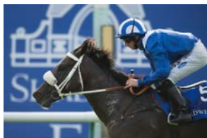
Soft Falling Rain Racing Post