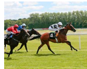
Hoop of Colour Racing Post

+ HOOP OF COLOUR (f, 3, Distorted Humor --Surya {MGSW-US, $400,965}, by Unbridled ) , runner-up at Windsor on debut May 19, raced wide of the main body of the field initially before joining