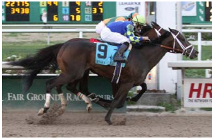
Intense Holiday