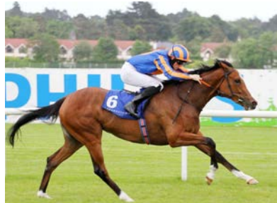
Queen of Nefertiti