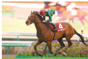
Just a Way

Japan's Just a Way (Jpn) (Heart's Cry {Jpn}) remained atop the leaderboard of the Longines World's Best Racehorse rankings when updated standings were released yesterday. The 5-year-old earned a mark of 130 for his record-breaking win in the G1 Dubai Duty