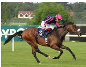
Majestic Queen