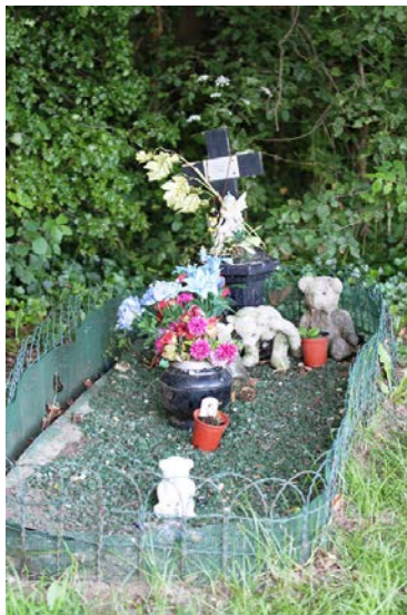
The gypsy boy's grave

Through the ages, the Gypsies have played a role in the Sport of Kings, and none more so than at Epsom. In 1770, Edward Smith Stanley, the 12th Earl of Derby, organized the Oaks and a year later the colts' equivalent, the Derby, was added, the name famously decided by the flip of a coin between the Earl of Derby and Sir Charles Banbury. The Earl of Derby may have won the toss, but Sir Charles Banbury's Diomed won the inaugural race.