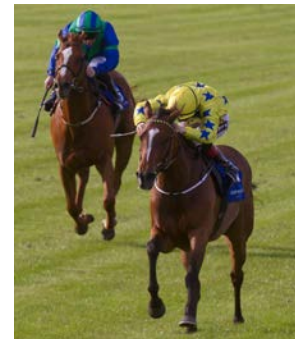
Pearl of Africa