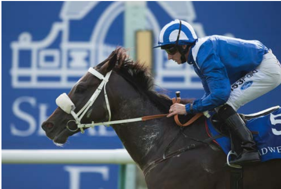
Soft Falling Rain Racing Post