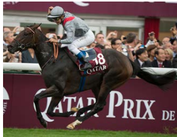
Treve Racing Post