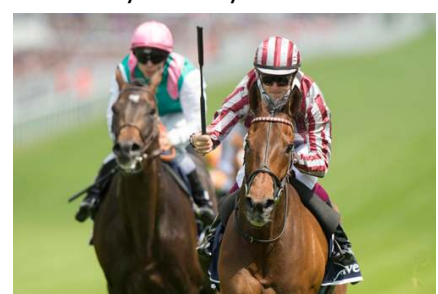
Cirrus des Aigles Racing Post

small shadow, but on the whole the report is not too bad, which is fantastic. He will have some more X-rays in a few days and we will know more at the end of the week, but he had some medication yesterday. He has not had any since and he seems well this morning."