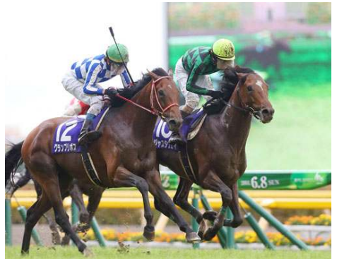
Just a Way

Yesterday's G1 Yasuda Kinen marked the first public appearance for Just a Way (Jpn) (Heart's Cry {Jpn}) since his 6 3/4-length record-setting demolition of the G1 Dubai Duty Free Mar. 29, and while yesterday's victory lacked the authority of his romp in the desert, the world's highest-rated horse nonetheless resumed a winner while extending his unbeaten streak to four.