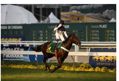
Bal A Bali ABCPCC

South America added another exciting Breeders' Cup contender to its roster when Brazilian Triple Crown champion Bal a Bali punched his ticket to the Nov. 1 Gl Breeders' Cup Turf with an impressive victory in Rio de Janeirois marquee race, the G1 Grande Premio Brasil on