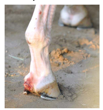
California Chrome suffers bloodied foot in Belmont loss.