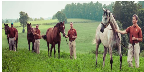
Darby Dan Farm Diana Winners from left to right: Wonder Again, Pletny of Grace, Memories of Silver, and Winter Memories.

Darby Dan Farm is home to four winners of Saratoga's GI Diana S., which is being held Saturday. All four mares are Darby Dan homebreds that were raced by the farm as well and are now members of their broodmare band.