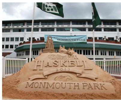
Monmouth Park prepares for Haskell weekend