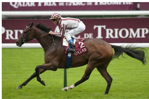
Cirrus des Aigles Racing Post

With St Nicholas Abbey (Ire) (Montjeu {Ire}) sadly absent, tomorrow's G1 King George VI & Queen Elizabeth Diamond S. at Ascot has lost much luster, but Cirrus des Aigles (Fr) (Even Top {Ire}) may be able to provide some compensation if he can put in anything approaching his best. Not sharp