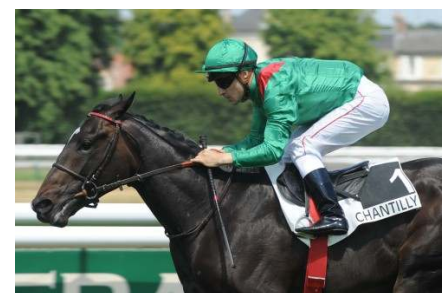
Daraybi is eased up at the line

Standing out in the preliminaries, Daraybi was hammered into 6-4 favoritism and did not disappoint his significant band of supporters, producing an explosive performance in this debut. His Highness The Aga Khan's homebred bay was sharply away from an outside gate and led from the outset.