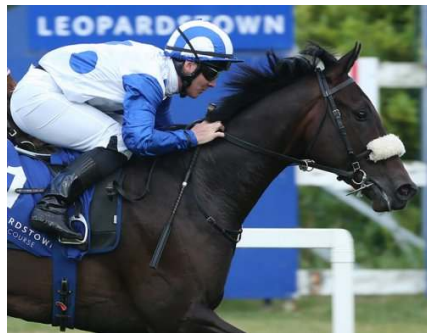
Exogenesis Racing Post