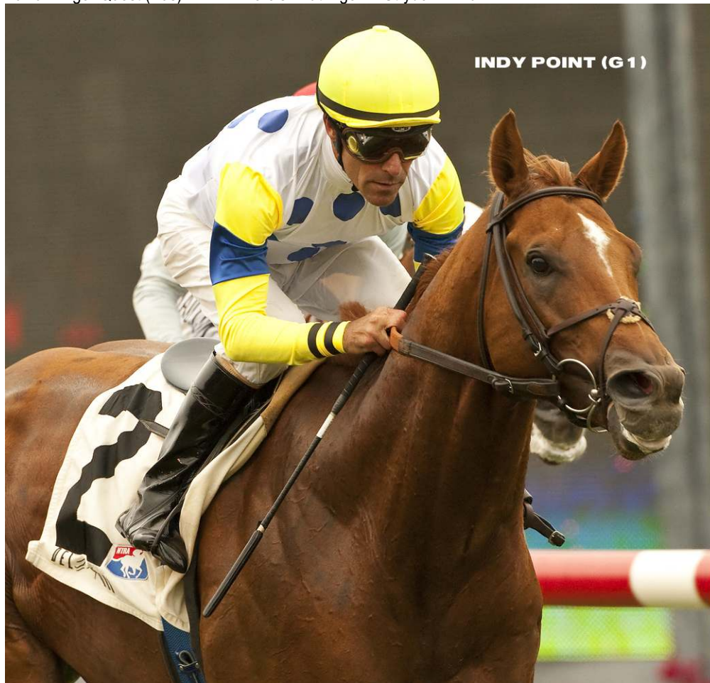
INDY POINT (G1)