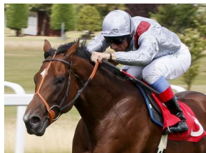
Shamshon & Dettori Racing Post

+ SHAMSHON (IRE) (c, 2, Invincible Spirit {Ire} -- Greenisland {Ire} {MSP-Eng & SP-Ger}, by Fasliyev ), a 420,000gns TATOCT yearling, broke well and held a slender advantage along the rail through halfway in this