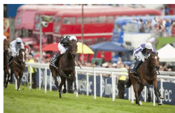
Was