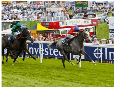
Clinical

Clinical, third behind the top-class Antara (Ger) (Platini {Ger}) in this event as a 3-year-old 12 months ago, returned to boss these rivals and earn a vital first pattern-race score for her owner/breeders. Having won three listed contests over a mile at the end of last term on the turf at Cologne and on the Polytrack at Lingfield and Dundalk, the homebred rounded off her campaign with a third in the Listed Hyde S. at Kempton in November. Breaking well to race in a prominent second as Barefoot Lady cut out the running against the rail, the grey started to assert from the three-furlong pole and was beyond recall by the time Joviality found