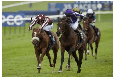
Camelot winning the 2000 Guineas from French Fifteen

"We are under no illusions with the Derby," Aidan O'Brien said. "We had two very special horses in High Chaparral and Galileo, and have not won it since. The race is a very difficult test of a horse. There cannot be any chink in their armor and everything has to go right on the day. With Camelot, I suppose it was always one race at a time, and we really hope if we put him to different tests he is able to pass them. He always has been a very special horse from the time he was born and we are very lucky to have him. For the future of the breed, they have to sit the exams and do the big