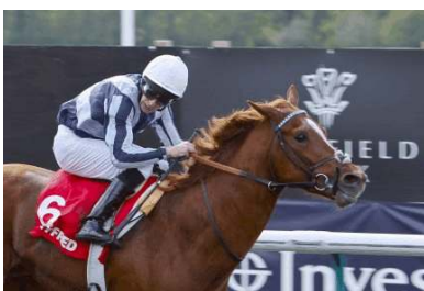
Main Sequence