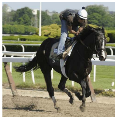
Street Life stretches his legs at Big Sandy Friday

Deep closers always get some extra looks in the GI Belmont S. Pundits and handicappers tend to assume that the more time a horse has to make up ground, the