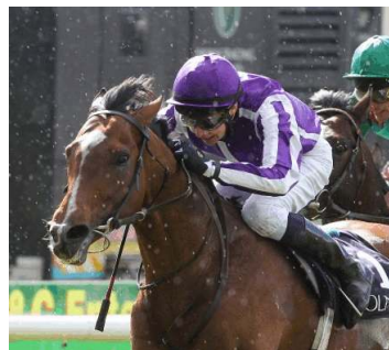
St Nicholas Abbey

Two years ago, St Nicholas Abbey (Ire) (Montjeu {Ire}) was on the sidelines as the Epsom Derby was being staged without him, but he returned here last year to make up for lost time when winning the