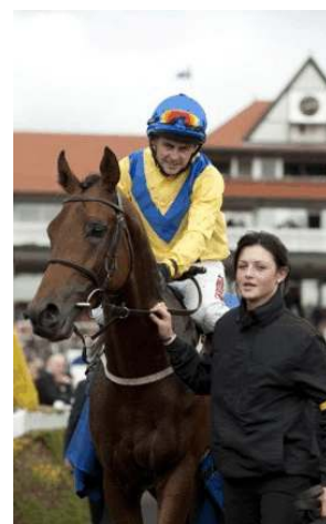
Mickdaam