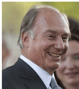
H H the Aga Khan