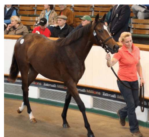
Was selling as a yearling

Was's granddam Park Express (Ire) (Ahonoora {GB}) captured the G1 Irish Champion S. as a 3-year-old in 1986. She achieved some success early in her career as a broodmare for Lodge Park Stud by producing Shinko