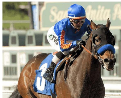
Game On Dude

Game On Dude (Awesome Again) makes his first start since a disastrous trip to Dubai in today's GII Californian S. at Betfair Hollywood Park, and will try to get back to the form that saw him win the GI Goodwood S. and run a strong second in the GI Breeders' Cup Classic last fall. A romping winner of