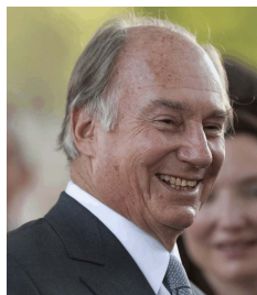
H H the Aga Khan

Undefeated Kesampour (Fr) (King's Best) will look to give his owner His Highness the Aga Khan a remarkable eighth G1 Prix du Jockey Club when the G2 Prix Greffuhle hero faces a full field of 20 rivals over 2100 meters at Chantilly Sunday.