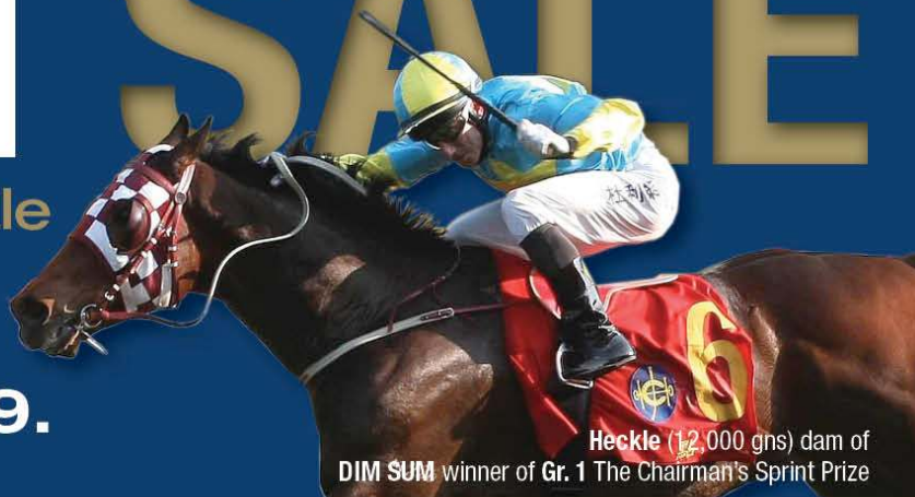
Heckle (12,000 gns) dam of DIM SUM winner of Gr. 1 The Chairman's Sprint Prize

Source of the dams of 3 Group 1 winners since 2009.