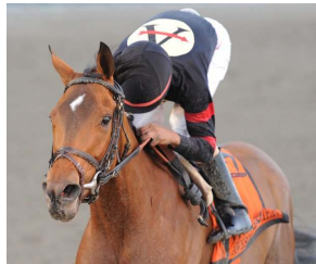
Awesome Feather