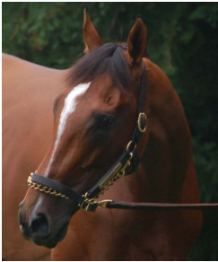
Mucho Macho Man Sherackatthetrack

Florida-breds take the spotlight in a series of six races at Gulfstream Park Saturday, headed by the $400,000 Sunshine Millions Classic. Reeves Thoroughbred Racing and Dream Team One Racing Stable's