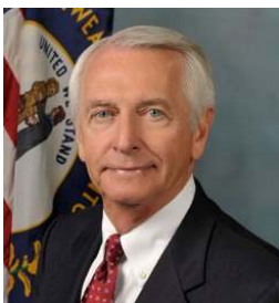
Gov. Steve Beshear

A constitutional amendment on casino-style gambling in Kentucky could be introduced in the Senate within the next couple of days, it was revealed late Wednesday evening.