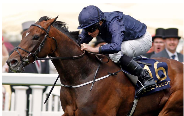
Deep Impact's 'TDN Rising Star' September

we knew she was fairly good-we were staggered when she drifted so much at Salisbury because we hadn't gone all the way to Salisbury expecting to come nowhere," he explained. "We went there principally also to win the Tattersalls bonus as she was one of the cheapest horses in the Book One sale last vear and we were determined to win a bonus with her. So we got that last Sunday and it was too late then to enter her in anything other than the