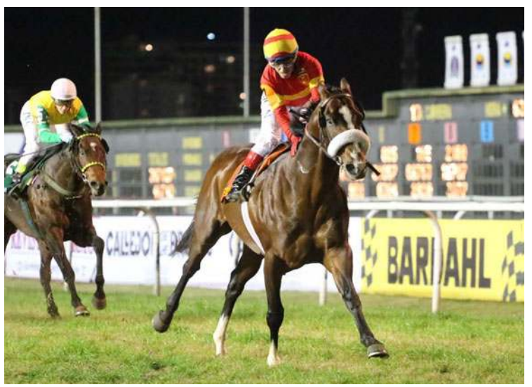
Crazy Icon validates long odds-on favoritism in the Estrellas Classic HSI photo