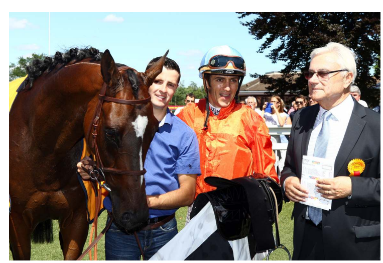
The happy connections of Best Fouad

Half to Listed Foundation S. winner Rawyaan, Best Fouad descends from the GI Vanity H. winner Cascapedia (Chieftain), whose best progeny proved to be the GII Malibu S. winner Glacial Stream (Crystal Water) and GIII Rancho Bernardo Breeders' Cup H. scorer Cascading Gold (Mr. Prospector). She is also the dam of the UAE highweight and GII Palos Verdes H., GII Potrero Grande Breeders' Cup H. and GII San Carlos H. winner Big Jag (Kleven) from the family of the GI Prioress S. winner Acey Deucey (Abaginone), G1 AJC Oaks and G1 Ranvet S. heroine Republic Lass (Aus) (Canny Lad {Aus}), G1 Durban July winner The Conglomerate (Aus) (Lonhro {Aus}), G1 Queen Elizabeth II Challenge Cup S. winner Captive Miss (Acaroid) and the GIII Southwest S. scorer and GI Arkansas Derby runner-up Far Right (Notional). Click for the Racing Post result. Video, sponsored by Fasig-Tipton.