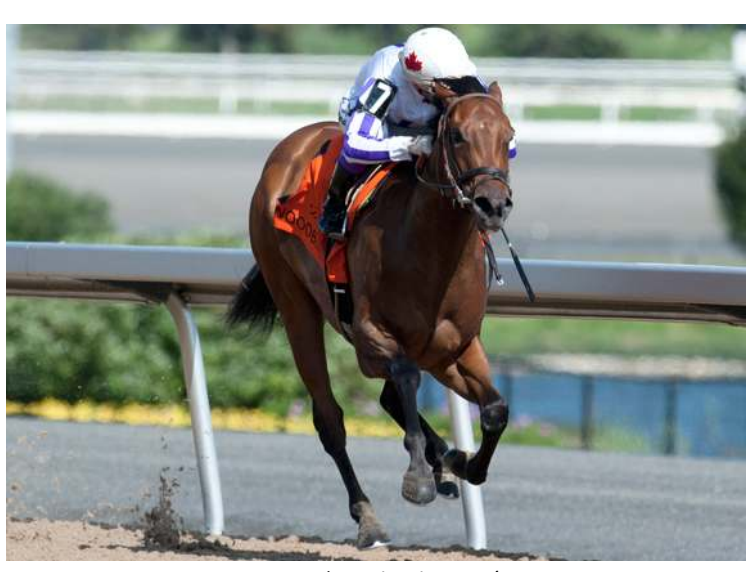
Dream It Is