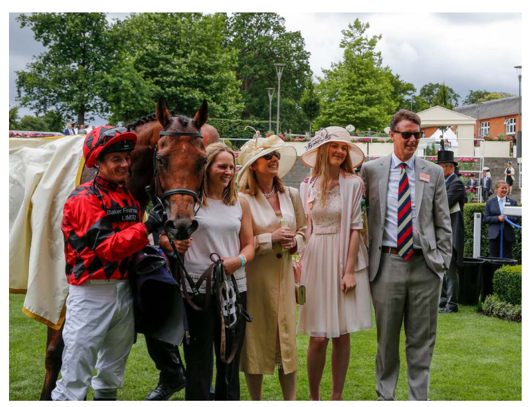
Snoano and winning connections | Racing Post

Snoano was bred at Minster Stud by Willie Carson out of a daughter of the G1 Moyglare Stud S. and G2 Cherry Hinton S. third Pearl Dance, who is also responsible for the G3 Prix Chloe scorer and G1 Prix d'Ispahan and G2 Prix de la Nonette-placed Sparkling Beam (Ire) (Nayef) and also Rainbow Springs (GB) (Selkirk), who was third in the G1 Prix Marcel Boussac. Also from the family of the G1 Melbourne Cup hero Delta Blues (Jpn) (Dance In the Dark {Jpn}), the dam has a 2-year-old colt by Kodiac (GB) named Stealth (GB).