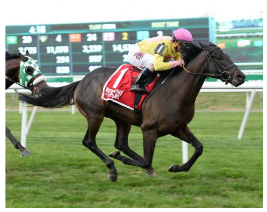
Offering Plan | Chelsea Durand

Offering Plan flashed considerable talent from day one and became a stakes winner with a score in the English Channel S. at Belmont in October 2015. Fifth in the GI Hollywood Derby to