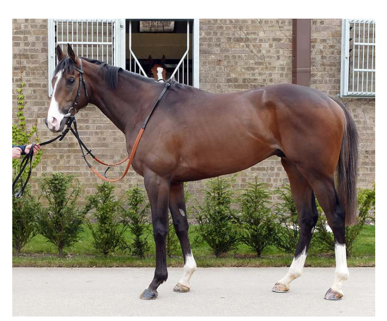
Escobar pictured at Hugo Palmer's stables last month | Emma Berry