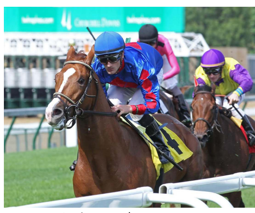
Sonic Boom

9th-CD, $50,010, Alw, 5-29, (NW3L), 3yo, 1mT, 1:36.11, fm. SONIC BOOM (c, 3, More Than Ready-Silent Circle, by Indian Charlie) graduated over the Kentucky Downs turf last September and placed in Santa Anita's Zuma Beach S. going a mile Oct. 10. He closed out his 2-year-old season with a third-place finish in a one-mile optional claimer on dirt here Nov. 10.