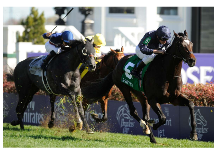
Wrote winning the Breeders' Cup Juvenile Turf