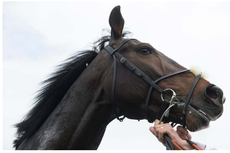
Eminent | Racing Post