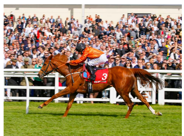
Mix And Mingle | Racing Post