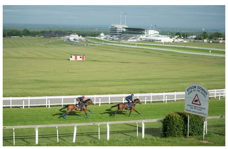
Cracksman & Pealer experience the Epsom contours