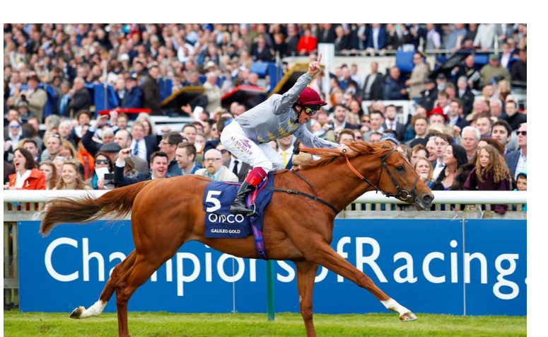
Galileo Gold | Al Shaqab Racing