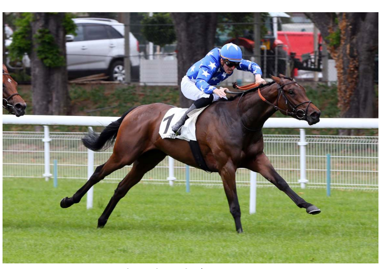
Lightupthenight | Scoop Dyga