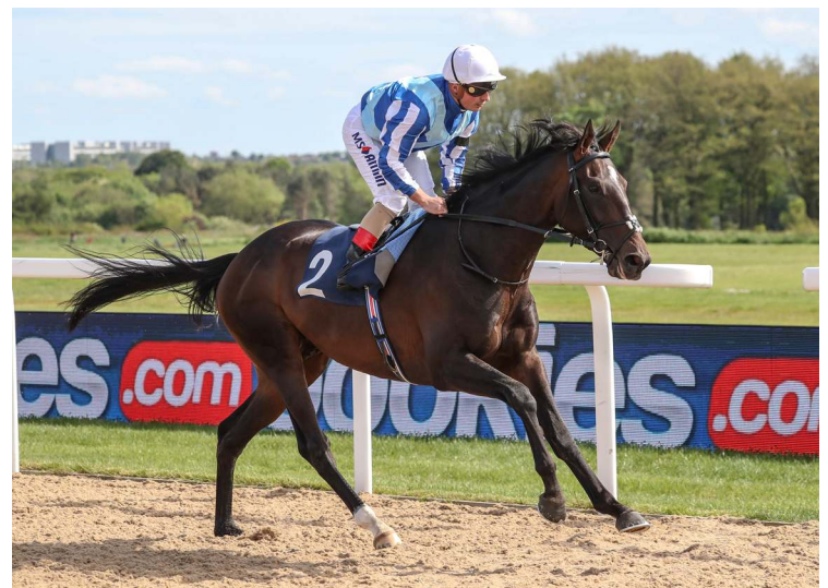
Master Singer | Racing Post