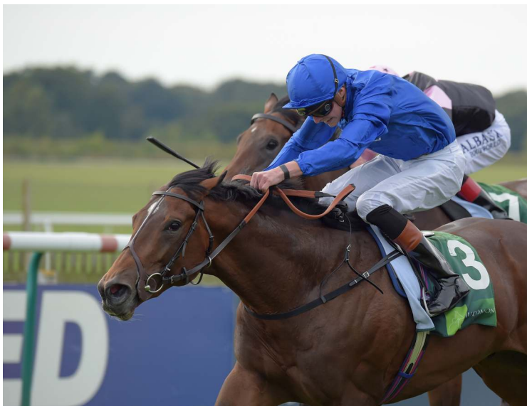
Best of Days | Racing Post

Godolphin looks to have a strong challenge this year, but time could be running out for 'TDN Rising Star' Best Of Days (GB) (Azamour {Ire}). He has not raced since taking the G2 Royal Lodge S. last September and, his stretch with Kidmenever (Ire) (Baltic King {GB}) looked adequate rather than spectacular.