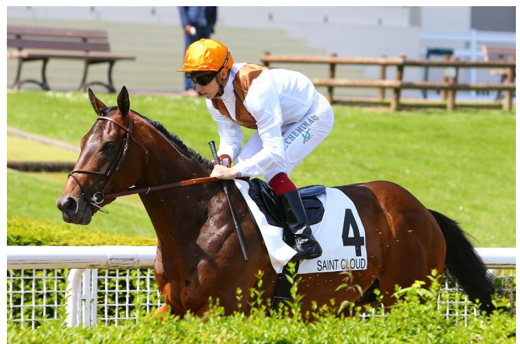
Trais Fluors

Trais Fluors lined up for this black-type bow coming off wins going 7 1/2 furlongs at Maisons-Laffitte Oct. 7 and over a mile at Compiègne on seasonal return last time Apr. 24, and maintained his perfect record with a smooth score. Employing a watching brief positioned last of the four runners until nudged along soon after turning for home, he quickened smartly to challenge entering the final eighth and kept on powerfully under minimal coaxing in the closing stages to claim a career high with ease from the pacesetter D'bai and TDN Rising Star Ratiocination. "He's a nice-looking horse, who won well producing a nice turn of foot and will return in the [June 17 G3] Prix Paul de Moussac [at Chantilly]," revealed trainer Andre Fabre.