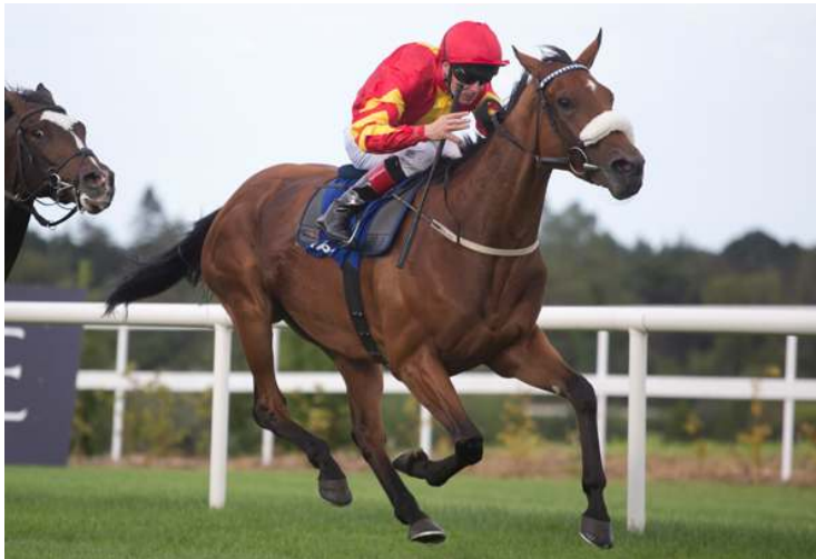
Zhukova | Racing Post

horse in Ireland and he won the GI Secretariat S. at Arlington for me. That's much tougher to do now because turf racing is being better recognised in America and also more high- class dirt horses are transferring to run on grass." Cont. p3