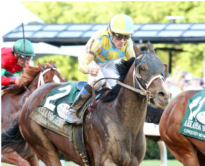
Classic Empire

of convincing victories in the GI Claiborne Breeders' Futurity at Keeneland and GI Sentient Jet Breeders' Cup Juvenile at Santa Anita, landing him unanimous honors as Champion 2-Year-Old Male at the Eclipse Awards in January.