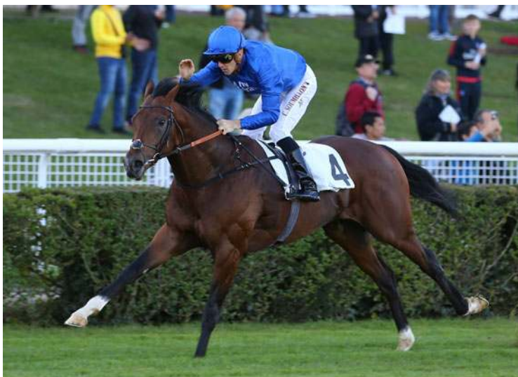
Thunder Snow winning the G1 Criterium International