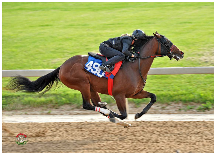
Hip 490