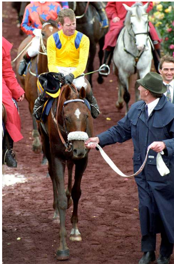
Vintage Crop after winning the 1993 Melbourne Cup

whether he would make the race and it was only in the final moments that we were happy he was okay to take his chance. It all worked out though and that was a proud day, and equally so when Harzand went on to win a third Irish Derby for me later that month at The Curragh," says the trainer. Cont. p5