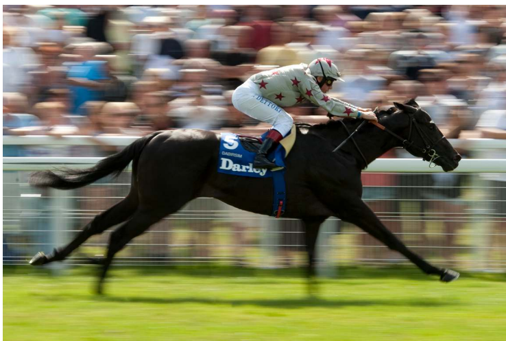
Dabirsim during his racing days