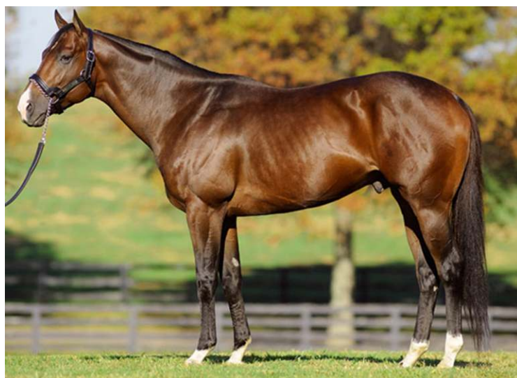
Maclean's Music | Hill 'n' Dale

Bodemeister won the 2012 GI Arkansas Derby and ran second in the Kentucky Derby and the Preakness; even civilians may have heard of him. Dialed In won the GI Florida Derby in 2011, while Union Rags won the GI Champagne S. as a 2-year-old and the GI Belmont S. in 2012 after I'll Have Another was injured pre-race and in the absence of Bodemeister, too. But Maclean's Music; who is he?