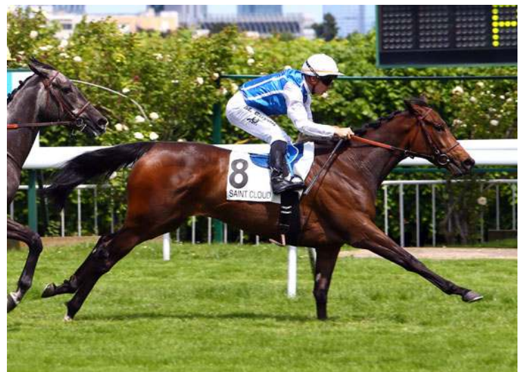
Terrakova (Galileo-Goldikova)