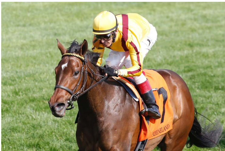
Lady Aurelia