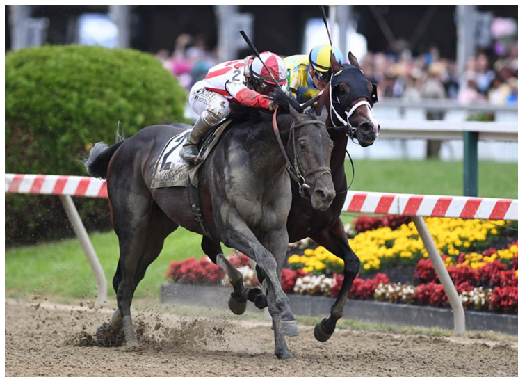
Cloud Computing

Like Always Dreaming in the Derby, Cloud Computing returned a Beyer of 102 in the Preakness. Those figures are on the low side, though it's not surprising as going into the Derby the top two-turn Grade I/II 3-year-old figure was Irish War Cry's 101 in the Wood, and Classic Empire had run 102 when wrapping up last year's juvenile championship in the GI Breeders' Cup Juvenile. In fact, as the attached table illustrates, the average winning Beyers for all three Triple Crown races have declined by six points and change in the last nine years (2009-2017) compared to the first nine years of the new millenium (2000-2008). Specifically: the 2000-2008 average winning Kentucky Derby Beyer was 109.3; in the last nine years, 2009-2017, the average winning Beyer is 102.7 (-6.6). In the Preakness, the average winning Beyer has declined from 110.7 to 104.3 (-6.4); and in the Belmont (not including 2017, obviously) the decline has been from 105.0 to 99.0 (-6.0). In fact, American Pharoah's 105 when he completed the 2015 Triple Crown was the only time the winning Beyer in the Belmont has been above 100 since 2007; given that statistic, it's definitely true that America is not breeding 12-furlong horses any more.