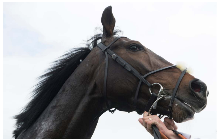
Eminent | Racing Post