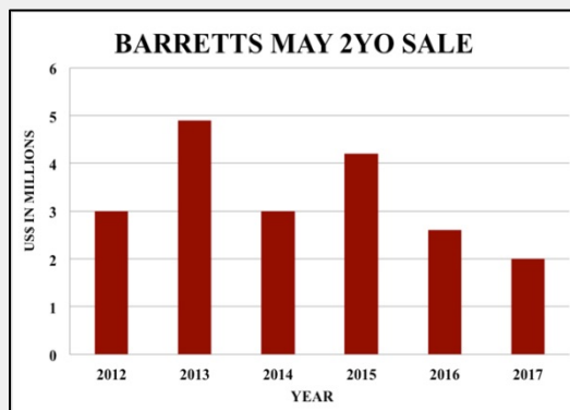
BARRETTS MAY 2YO SALE

“With the number sold (46) and gross half or less than just two years ago, there had already been a lot of talk pre-sale that Barretts May 2-year-old sale would be combined with their March sale, and that seems certain now to be the case, although the average has basically remained stable. With Fasig’s Mid-Atlantic sale wrapping up yesterday but not included in these figures, the US 2-year-old sales are up 14% in gross and 13% in average from last year, though if we measure it against the latest market peak in 2015 the gross is up a little under 10%. The clearance rate from the catalogues hasn’t improved though, hovering right around 51%, which does mean once you enter one in the sale, it’s still only a 50-50 shot whether it actually gets sold. Pinhooking 2-year-olds is definitely not a business for the faint of heart.”