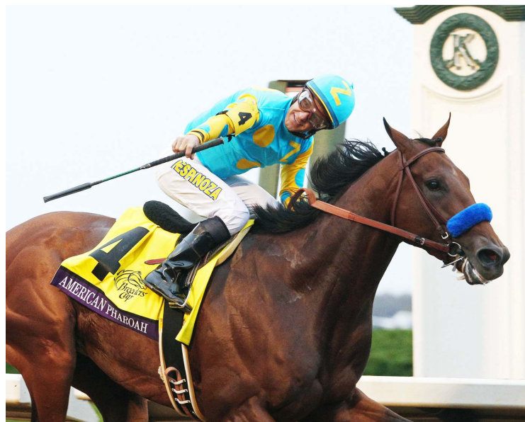
American Pharoah