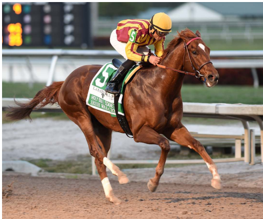
Irish War Cry

But a more subtle sign of this ' TDN Rising Star 's prowess actually occurred a furlong before that, when the undefeated New Jersey-bred sensed the odds-on divisional champion ranging up to within a length of his outside flank, primed to pounce, and Irish War Cry, all on his own, quickened away without being asked. That reaction alone was impressive, but to give the