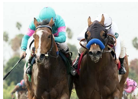
Gormley & American Anthem (r) battle in the Sham

American Anthem's pedigree portends distance ability: His dam is a half-sister to the 1998 champion 3-year-old filly Banshee Breeze (Unbridled), who won multiple Grade I races up to 1 1/2 miles, and sire