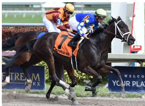
Eskenformoney