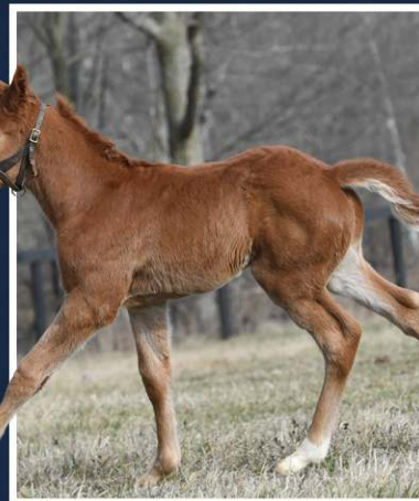
Colt o/o Shot Gun Pennie