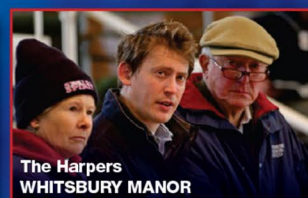
The Harpers WHITSBURY MANOR