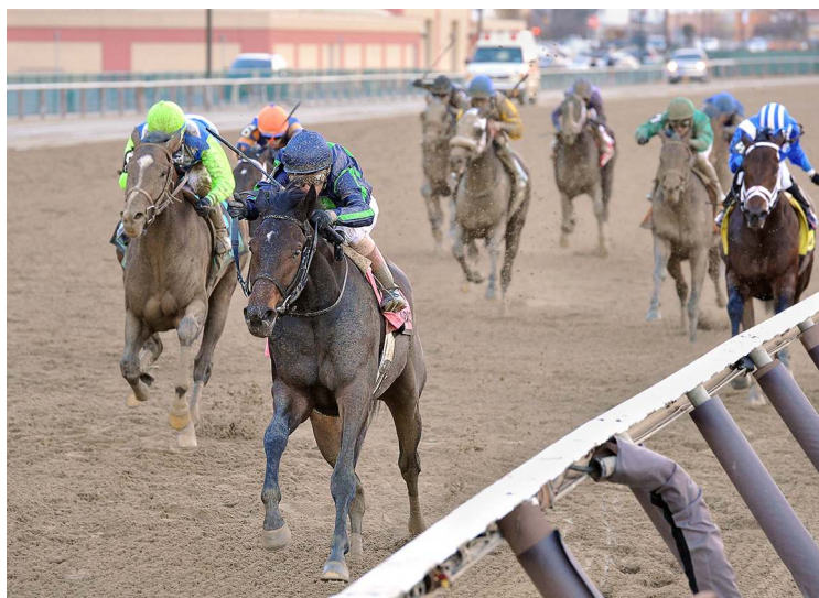
Mo Town