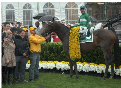
Exaggerator

There was a great deal to like about Irish War Cry's performance in the Holy Bull S.--a race whose last six winners included Mohaymen (who went on to win the GII Fountain of Youth and finish fourth in the GI Kentucky Derby), Upstart (who finished second in the Fountain of Youth and the GI Florida