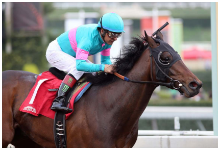
Royal Mo