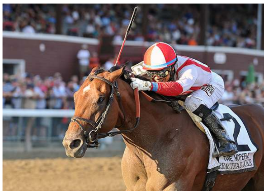
Practical Joke