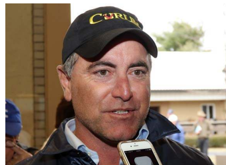
Donato Lanni | Fasig-Tipton photo