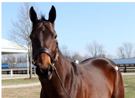
Super Majesty