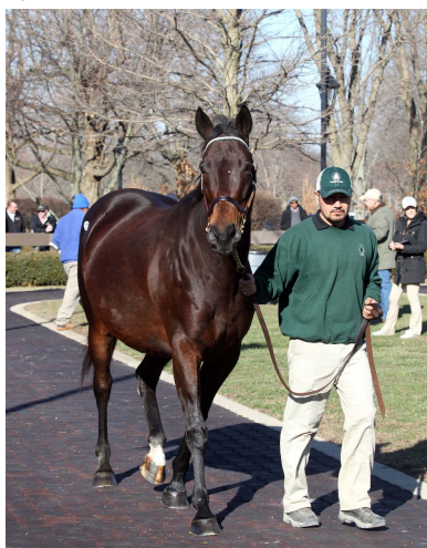
She's All In

Vinery Sales consigned the Rockin' Z Ranch horses at the February sale. The operation is being liquidated due to personal reasons surrounding the Zoellner family.