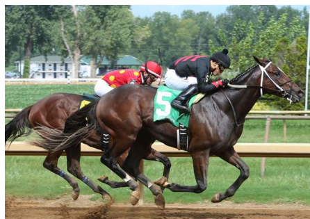
Lookin At Lee

Last Start: 4th, GI Sentient Jet Breeders' Cup Juvenile , SA, Nov. 5