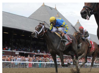
Uncle Vinny

Starlight Racing's 2015 GIII Sanford S. winner Uncle Vinny (Uncle Mo--Arealhotlover, by Untuttable) has been retired to