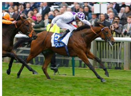
Parish Hall | Racing Post

Goffs kick off the first of three days of their extended February Sale Tuesday. Day One action, which commences at 10 a.m. local time, begins with a mixture of 2- and 3-year-olds, horses in training and even a potential stallion prospect in G1 Darley Dewhurst S. winner Parish Hall (Ire) (Teofilo {Ire}), offered as lot 84 . From that lot onwards, the focus switches to 'short yearlings' as the sale bids to recapture the ground it lost last year following a very successful 2015 edition. A larger catalogue should help