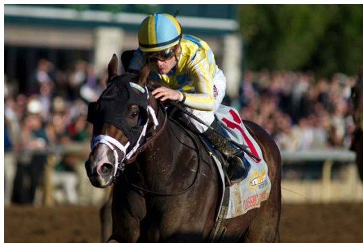
Classic Empire

Classic Empire's lackluster third-place effort in the Holy Bull S. at 1-2 odds has to be viewed in the context of his esteemed status as juvenile champion and with all of the lofty expectations he carried into his seasonal debut, which is the reason for his