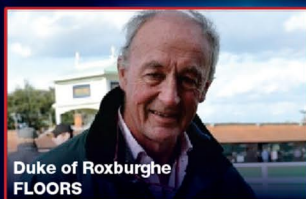
Duke of Roxburghe FLOORS