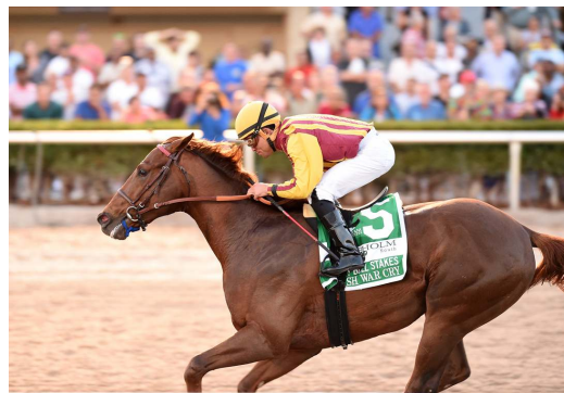
Irish War Cry

However, the first half of his stallion career had seen Curlin's