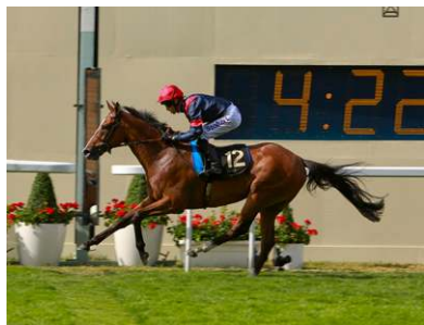
Trip To Paris

The Australian Turf Club have revealed a significant increase in entries for The Championships in Sydney, run over two consecutive Saturdays in early April. A total of 1371 nominations