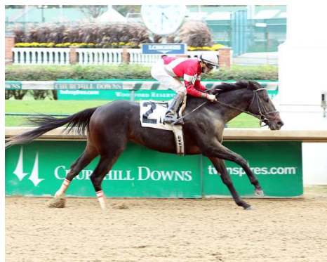
McCraken