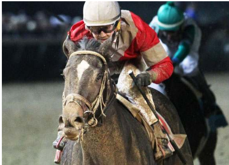
McCracken | Coady Photography