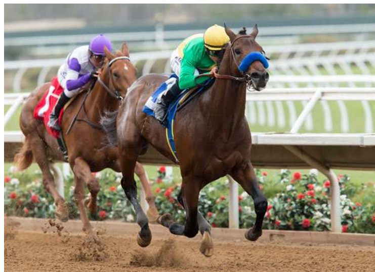
Mastery

'TDN Rising Star' Mastery is a May 3 foal. If he makes it into the starting gate for the Derby, will it make a difference that he's conceding several months of experience to somewhat older sophomore peers? In the past 30 years, only Mine That Bird (Birdstone), foaled on May 10, and Thunder Gulch (Gulch), on May 23, have won the Derby with a May foaling date (there have been at least 10 overall, but many pre-1935 foal dates were not recorded). Even if you think birth rank matters, is it enough to outweigh the trend that trainer Baffert has won four Kentucky Derbies and unquestionably knows how to get 3-year-olds to peak in the spring? This tall, broad-striding colt uncorked a bullet (1/30) half-mile training move Jan. 30 and a sharp (2/89) five-furlong move Feb. 5 in anticipation of a March start, which will be only one of just two planned races prior to the Derby if Baffert's stated game plan holds true. Right now Mastery is the fastest gun in the West, and whether he attempts to blaze a Derby trail via Oaklawn or remain at his training base of Santa Anita, it will likely result in some rethinking of plans by trainers whose lesser-ranked rivals might be better off avoiding him.