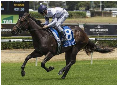
She Will Reign | Racing And Sports