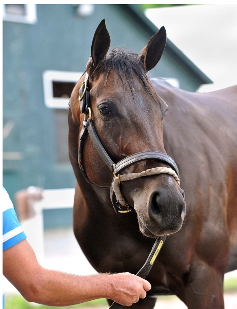
Tepin