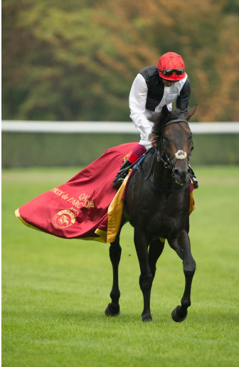
Golden Horn Racing Post