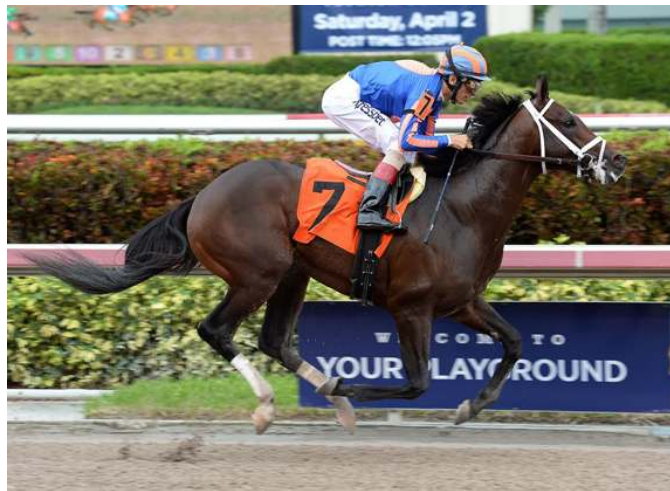
Zulu