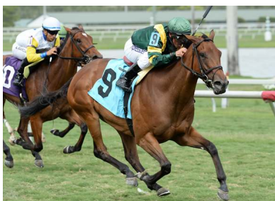
Take These Chains

Take These Chains took all the early money here for this top turf outfit, and drifted up to 5-2 at the off. Beaten for speed out of the blocks, the bay was taken in hand and maneuvered to the rail to bide her time towards the back of the pack. Inching closer while three deep down the backside, she continued to pick off rivals turning for home, but still had some five lengths to make up on the leaders entering the lane.