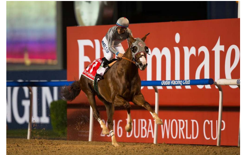
California Chrome winning the Dubai World Cup Saturday

Andre Fabre, author of the most spectacular experiment of all in Arcangues (Sagace {Fr}), evidently misplaced a parallel hunch about Vadamos (Fr) (Monsun {Ger}), beaten out of sight as the only European-trained runner in the World Cup. Yet how many of those who sniggered at the master trainer, for bringing so predictable a humiliation upon himself, had once watched Mubtaahij (Ire) (Dubawi {Ire})--a son of a Pennekamp (Bering {GB}) mare--finish down the field in two turf maidens and recognised an eight-length winner of the G2 UAE Derby and, now, a World Cup runner-up? Both the other dirt races on Saturday, moreover, were won by horses with putative turf