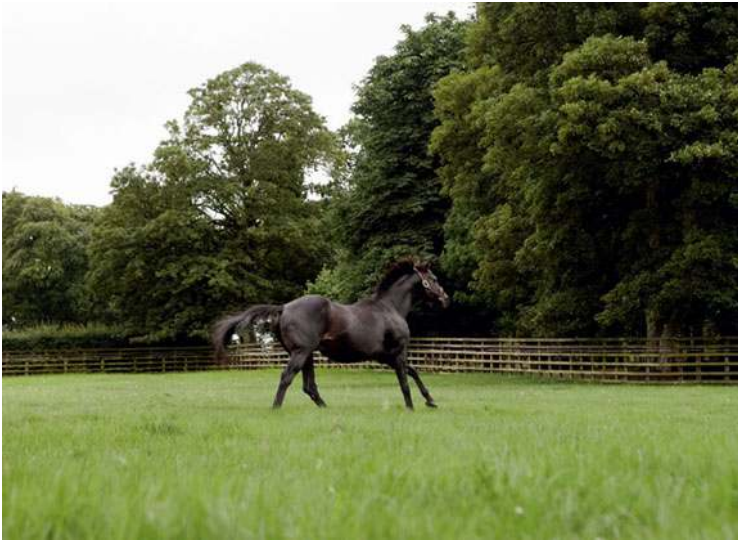
Cape Cross