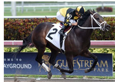
Sea Wizard

4th-GP, $41,000, Msw, 3-27, 3yo, 5 1/2f, 1:03.25, ft. SEA WIZARD (c, 3, Uncle Mo--Sea Road {MSW & GSP, $198,725} ), by Tale of the Cat), backed all the way down to favoritism for his Oct. 11 debut at Belmont, found only eventual GIII Sam F. Davis S. and GII Tampa Bay Derby hero Destin (Giant's Causeway) better that day. Showing an upbeat local tab in the interim while getting first-time Lasix, the $75,000 KEESEP yearling turned $190,000 OBS March juvenile was installed as the 2-5 chalk and didn't disappoint. Pressing a