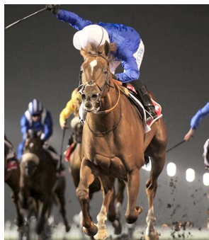
Hunter's Light Dubai Racing Club

Hunter's Light ran his record on all-weather tracks to an impressive four-for-five and provided Godolphin with its 200th Group/Grade 1 winner with an authoritative victory in this prep for the G1 Dubai World Cup. Successful in the Listed Churchill S. at Lingfield in November 2011, the homebred posted his first pattern score on turf in the G3 Lancaster S. at Haydock last summer before adding the Anatolia S. on the synthetic at Istanbul's Veliefendi Racecourse in September. A distant runner-up to Cirrus des Aigles (Fr) (Even Top {Ire}) in the