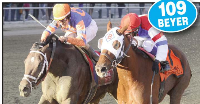
1 st Cigar Mile Handicap [G1] , 1m, Aqueduct, defeating the brilliant Groupie Doll