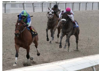
Delaunay

Delaunay has done little wrong since being haltered for $40,000 by these connections last May, winning six of seven starts--all stakes--with his lone loss coming in the Senator Robert C. Byrd Memorial S. at Mountaineer Aug. 4, where he finished fourth. The bay entered this contest off a wire-to-wire score over track and trip in the F.W. Gaudin Memorial S. Jan. 26, where he posted a 110 Beyer Speed Figure. Dueling for the lead from the outset here, the heavy