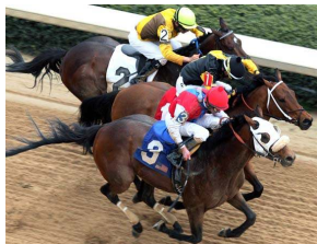
Cyber Secret

Old Tune (Brz) (Wild Event) wins the GIII Hillsborough S. Page 6