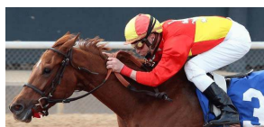
Rose to Gold

Rose to Gold (Friends Lake) wins the GIII Honeybee S. Page 5