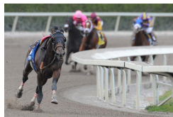
Fort Larned "loose" on the lead. A Coglianesse

The 2013 debut of last year's GI Breeders' Cup Classic winner didn't quite go to plan, leaving Discreet Dancer (Discreet Cat) to pick up the pieces.