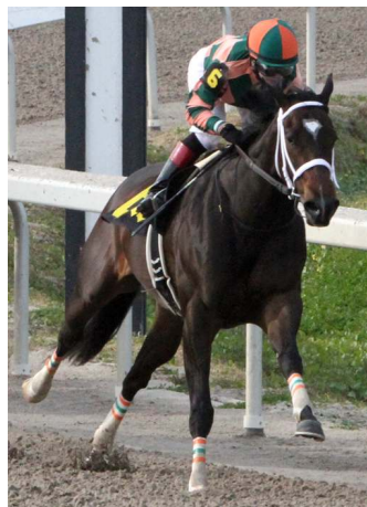
Believe You Can