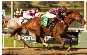
Hear the Ghost