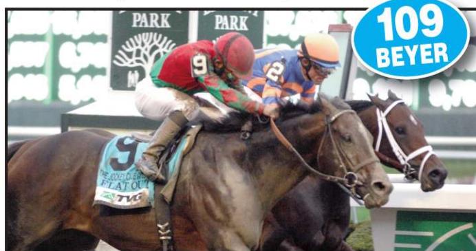
2 nd Jockey Club Gold Cup [G1] , 1 1/4m, Belmont Park, beaten a nose by Flat Out with subsequent Breeders' Cup Classic winner Fort Lamed 5 1/2 lengths back in third.