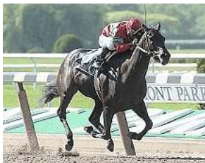
Wild Spirit

The brilliant racemare Wild Spirit (Chi) (Hussonet--Wild Princess, by Wild Again) has been retired from racing