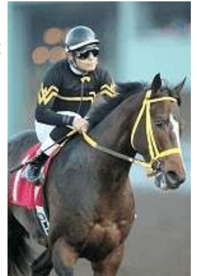
Omega Code Horsephotos