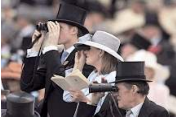
Royal Ascot 2002