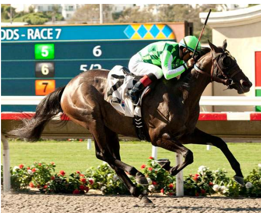
Sunset Glow

Having produced champions such as She's A Tiger (Tale of the Cat), Sweet Catomine (Storm Cat), Stardom Bound (Tapit), and Halfbridled (Unbridled), the