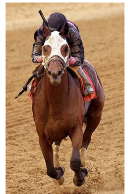
Kid Cruz