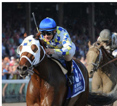
Moreno

Southern Equine Stable's Moreno (Ghostzapper) looks to become the first horse since Lawyer Ron (Langfuhr) in 2007 to complete Whitney/Woodward double in today's GI Woodward S. Last year's GI Travers S.