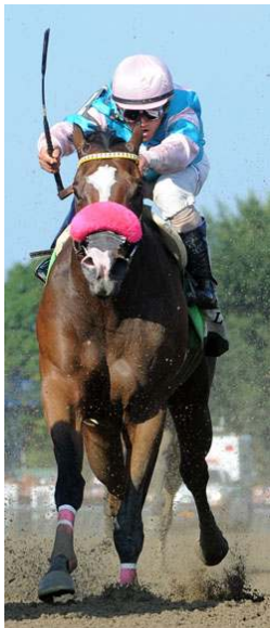
Miss Behaviour