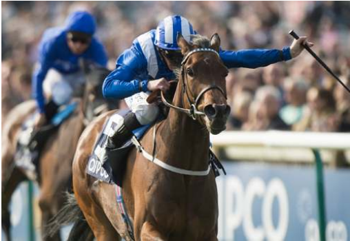
Taghrooda

Sheikh Hamdan's Taghrooda (GB) (Sea the Stars {Ire}) remains on track for a bid for the G1 Prix de l'Arc de Triomphe despite a shock defeat when second in the G1 Yorkshire Oaks Aug. 21, according to trainer John Gosden. The conditioner said he believes the G1 Investec Oaks and G1 King George VI and Queen Elizabeth S. heroine was undone by the quick going at York.