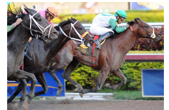
Csaba

Csaba (Kitten's Joy) looked beaten turning for home, but found his best stride late to take the GIII Hal's Hope S. by a neck at Gulfstream Park Sunday. Seeking his fourth straight win in this prep for the Feb. 9 GI Donn H., Csaba was sent off the 9-5 favorite. With the leaders in the early strides, the bay colt let the pacesetters go and settled into mid-pack. He was hard-ridden on the turn and seemed to lack the needed response while racing on the wrong lead in upper stretch, but he ducked over to the rail and snuck through to just get the better of the late-closing Pool Play (Silver Deputy) and Pants on Fire (Jump Start) in a blanket finish.