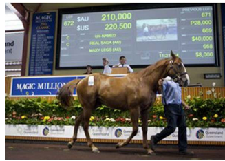
Lot 672

Real Surreal (Aus) provided racetrack success for her freshman sire Real Saga (Aus) Saturday and a pair of colts by the stallion led the way in the sales ring Sunday on the Gold Coast.