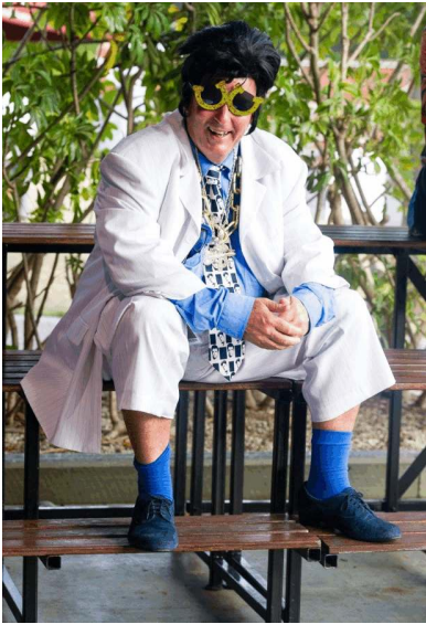
Elvis was in the building...