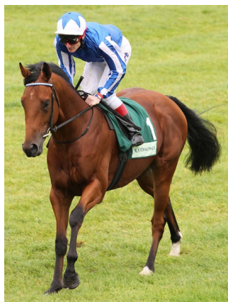
Akeed Mofeed prior to the Beresford Racing Post