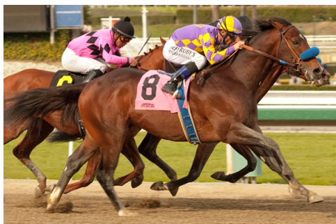
Demonic Gets Up

Demonic's reputation preceded him coming into this debut, and he was backed down to even-money off a strong local worktab, accentuated by a six-furlong bullet (1/21) in 1:12 flat over the strip Jan. 4. Allowed to lope along in mid-pack in the early going while kept out in the clear,