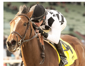
Snow Fall