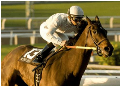
M One Rifle