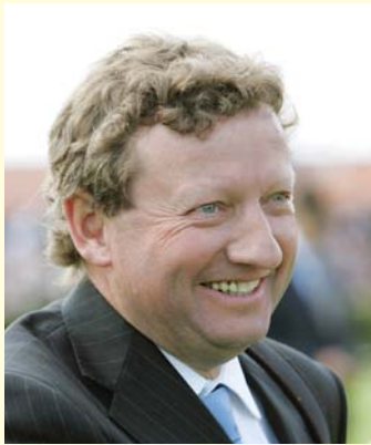
Mark Johnston

Firstly, let's be clear that I am not against the use of drugs in racing for the legitimate treatment of, and/or prevention of, injuries and ailments in racing horses. Much recent controversy surrounds the use of anabolic steroids and, for those, even although I consider them to be the most specifically performance-enhancing of drugs, I would still have cases where I would want to use them if they were permitted in this country. They are not, however,