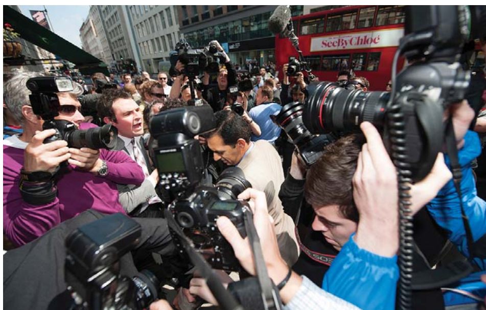
Mahmood Al Zarooni after suspension