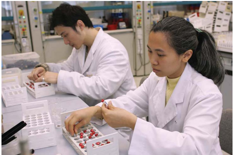
Hong Kong drug testing lab

"What I have seen here is the ability of horses to run well without medication and come back and have their next race within a short period of time and run well again," he said. "That to me was an eye-opener, a game-changer in terms of how you look at it. A horse would run at a high level in a high-class race, really